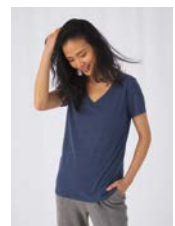
DUO CONCEPT with B&C TW058 V Triblend /women